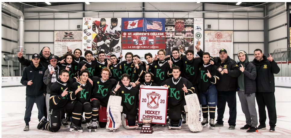
Our KCSS Tier 1 Hockey Team after winning the SAC Tournament a few weeks ago.

A must visit event for students considering their post-secondary options, or experiential travel/gap year programs. Representatives from over 100 universities/colleges from around the world will be at this prestigious student expo, to meet with students, and parents. Learn about program options, scholarships and admission requirements. Free admission. www.studyandgoabroad.com .